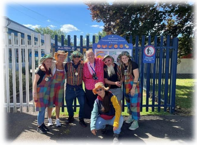
Local school visits above, donation of food below

Sensory Healing Rooms for spiritual and mental wellbeing