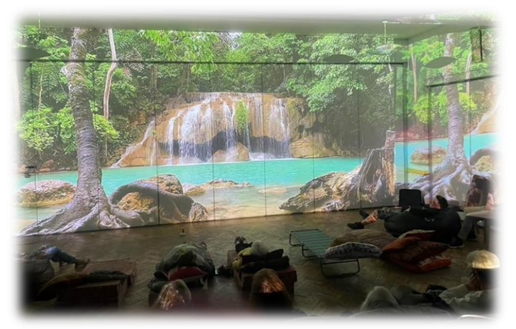
Summer Outdoor Activities