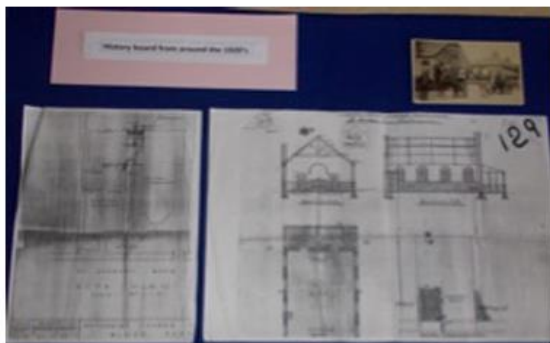
Plans of the Current Building