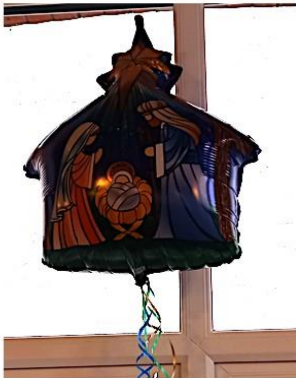
Sun catcher decorations