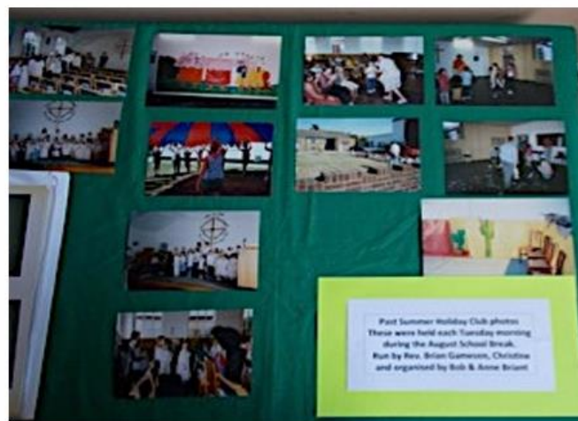
Summer Holiday Clubs