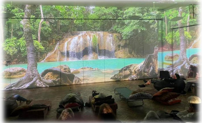
Summer Outdoor Activities