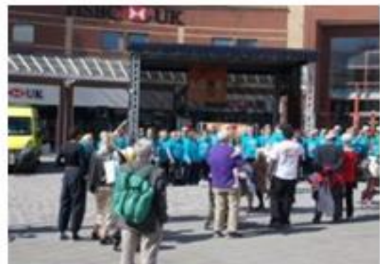
Flash mob Choir revealed