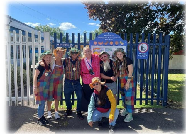
Local school visits above, donation of food below