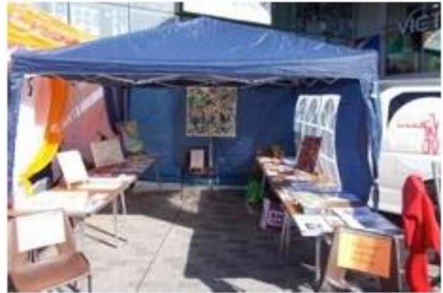
14 pieces to respond to by touch or viewing.

Each piece had an accompanying Bible text and questions for people to reflect on when looking at the pieces. They could take away postcards of the art pieces showing both the image and text. I had some conversations with people as they looked, and I heard personal stories which the art had reminded them of, needing peace, or the challenges in their lives. A real blessing to hear part of their story.