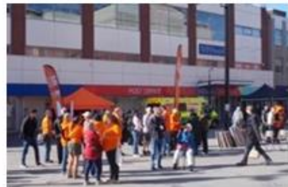
Crowds gathering /chatted to by the team

Each piece had an accompanying Bible text and questions for people to reflect on when looking at the pieces. They could take away postcards of the art pieces showing both the image and text. I had some conversations with people as they looked, and I heard personal stories which the art had reminded them of, needing peace, or the challenges in their lives. A real blessing to hear part of their story.